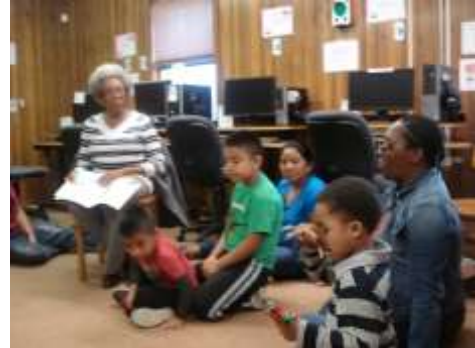
DPIIL Reading Night at the Hardeeville Library A visiting grandmother reads about bird watching before our outdoor excursion!

Children who register with Jasper County First Steps receive one book per month by mail through the month of their fifth birthday. Each book is carefully selected by a committee of educational specialists.