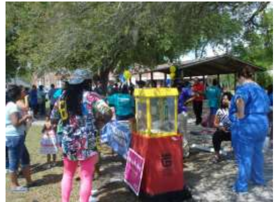
JCFS @ DSS Community Event April 2017 – Child Abuse Prevention Month

Early identification of children with special education needs helps them receive services as early as possible so they have the best chance of success in kindergarten and beyond.