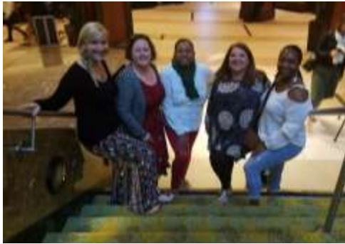
First Steps representing South Carolina @ NAEYC Conference, San Francisco, CA