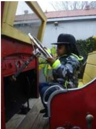
PAT participants enjoying the wonders at the Charleston Children's Museum (December 2017)