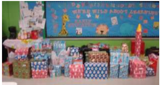
PAT Angel Tree – Christmas 2016 We collected over $1500 to purchase gifts for all the children in families in our PAT program! 58 children in all, including siblings!