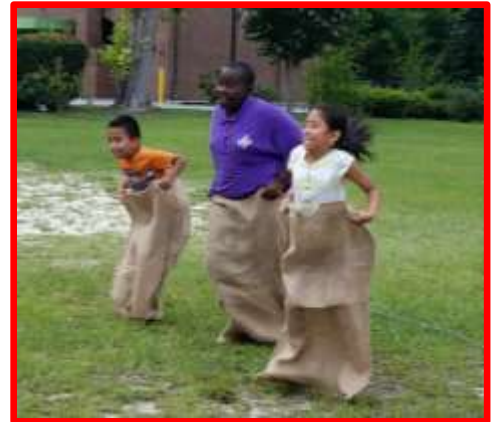
Older siblings showing them how it’s done! PAT Group Connection Turpin Park, Ridgeland

I have worked as a Parent Educator for a 1 ½ years and have seen countless times that detecting developmental delays early on can make a huge difference in a child’s life. Due to having completed the ASQ-3 and ASQ-SE assessments on a child I am currently serving, I was able to refer the child to BabyNet due to developmental delays. BabyNet was then able to refer this child out to MUSC who then diagnosed the child with Autism. Without the assessments I completed or the PAT program, this child and parent would not have been able to get the help they needed or have the child’s condition diagnosed at the age of 14 months.