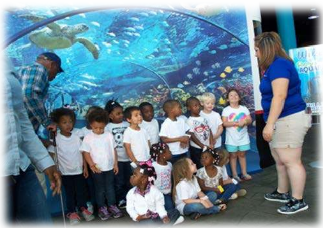
Ripley’s Aquarium, Myrtle Beach

TACO TUESDAY! WEEK OF THE YOUNG CHILD”. Children learning about different types of food. Each year we try to find different types of food to introduce and expose the children to. While engaged in this activity the children learned the colors and shapes of the ingredients as they made their own tacos