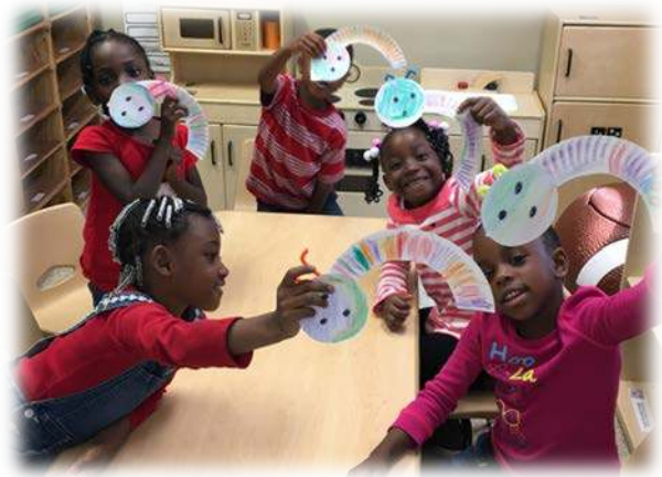
Making Shape Caterpillars