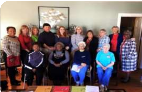
Pictured above are some of our most faithful volunteers.

Located on the campus of First Baptist Church of Pageland, BRC employs a holistic approach to family assistance, not only meeting immediate nutritional needs but also providing comprehensive assistance information and making spiritual guidance available to those who express such a need. BRC distributes emergency food and provides access to assistance by identifying appropriate resources and helping initiate the process for securing those resources through The Benefit Bank program.