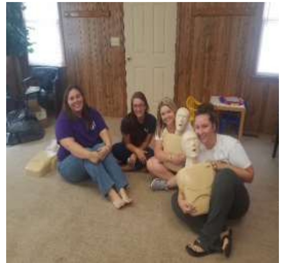
Having fun in CPR training!