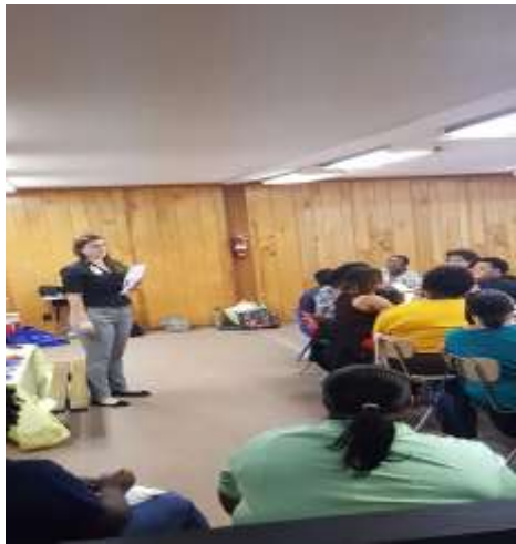
Childcare training, April 2017