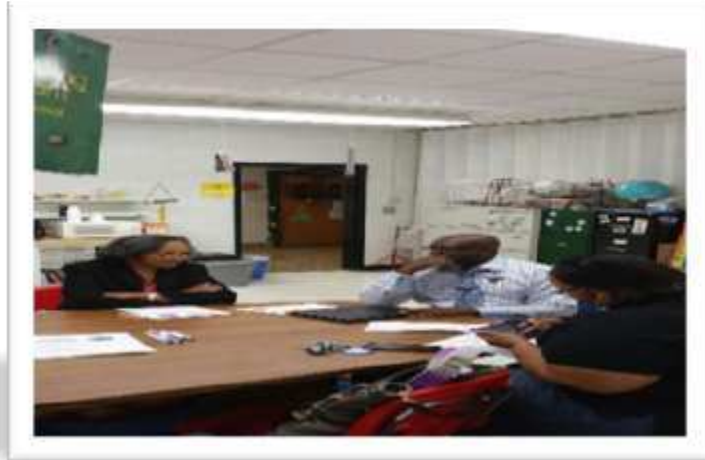
MCFS Board Members

Marlboro County First Steps, Marlboro County School District, and Marian Wright Edelman Library continue to collaborate for the children and families of Marlboro County by hosting events throughout the year.