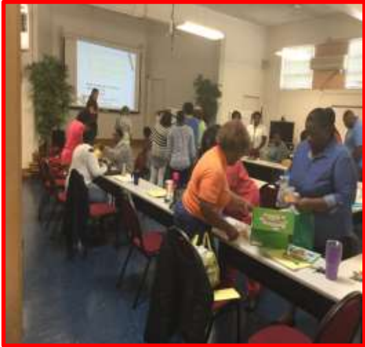
Childcare providers were engaged in hands on activities in small groups.