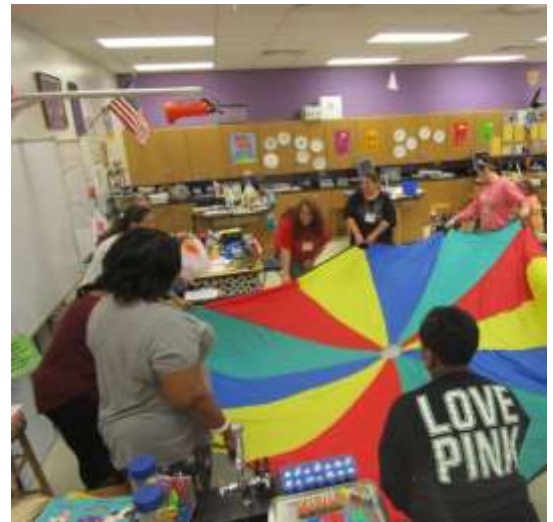
Education and learning can be fun...not only for children but also for adults!