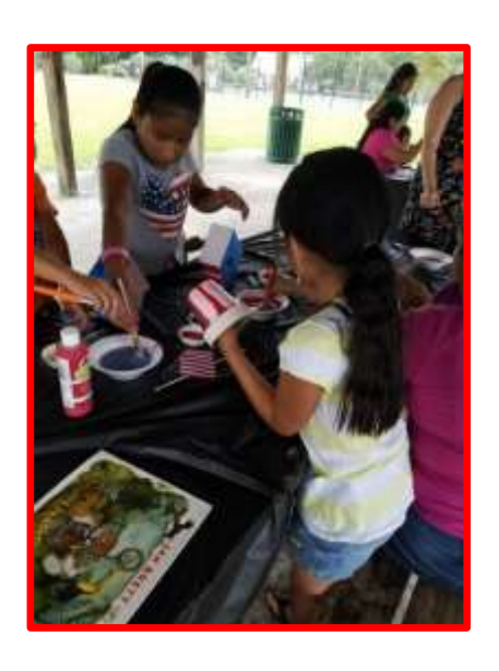
PAT Group Connection Summer Fun In The Sun! Turpin Park, Ridgeland