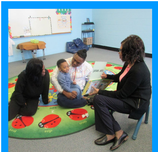
Parent Educator working with a family.

Connections to outside resources that families may need to succeed